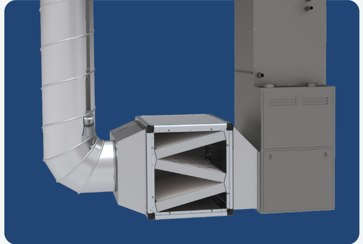
Engineered to seamlessly integrate into the return air stream of upflow, horizontal, attic, and basement HVAC systems.