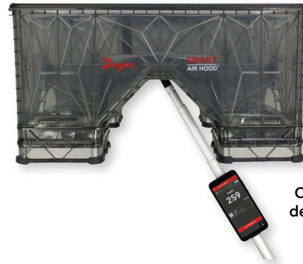
Optional handheld device UHH7 shown