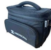
M/G/SP Series Pouch HM-SP01-POUCH

COMPLIANCE NOTICE: The thermal series products might be subject to export controls in various countries or regions, including without limitation, the United States, European Union, United Kingdom and/or other member countries of the Wassenaar Arrangement. Please consult your professional legal or compliance expert or local government authorities for any necessary export license requirements if you intend to transfer, export, re-export the thermal series products between different countries.