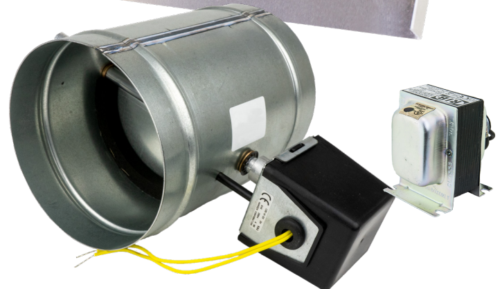
Panel cover included