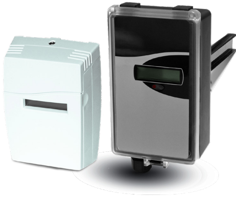
Sensors sold separately

Connecting the CO2 sensor to the over-ride terminals on our Fresh Air Ventilation panel activates the On Demand Ventilation function to provide fresh air into areas or rooms with high concentrations of CO2. Contact iO HVAC Controls for engineering and installation instructions and schematics.