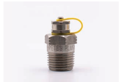
#810 Core Nordel Thread 1/2" NPT Length 1 1/2"

Please see pairing chart for product compatibility.