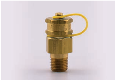
#12510 Core Nordel Thread 1/8" NPT Length 1 1/4"