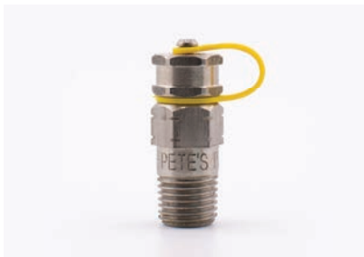
#410 Core Nordel Thread 1/4" NPT Length 1 1/2"