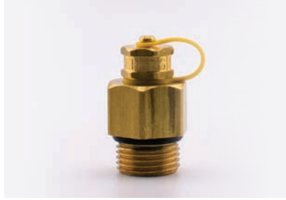
#760 Core Nordel with Buna-N O-Ring Sealant Thread 3/4"-16 NPT Length 1 1/2"