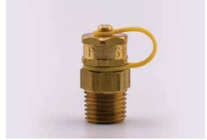
#910 Core Nordel Thread 1/4" NPT Length 1 1/5"