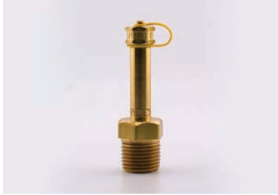
#710XL Core Nordel Thread 1/2" NPT Length 3"