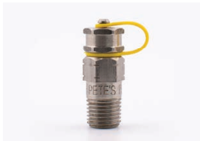
#410BSP Core Nordel Thread 1/4" BSP Length 1 1/2"