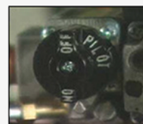
Turn gas valve to Pilot.