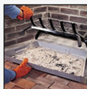
Remove or cover ashes

Refer to the Gauge QuickGuide & become completely familiar with its operation before performing a test.