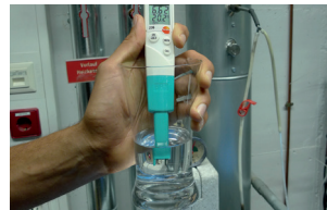
Ideally suitable for monitoring heating system water according to VDI 2035.