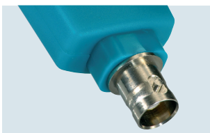
testo 206-pH3: pH3 probe head with BNC interface