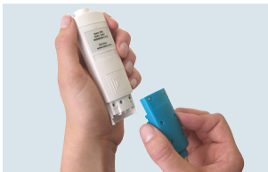
Easy exchange of probes with testo 206-pH1/-pH2/-pH3